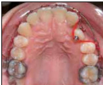
356 Moving a Blocked Tooth