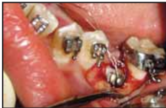
341 Unusual Crossbite